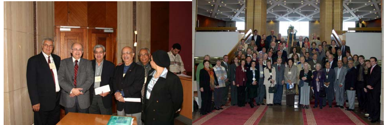
Baltimore Friends of the BA

Corner" placed in different public places in USA. The idea was accepted by the Library of Alexandria.