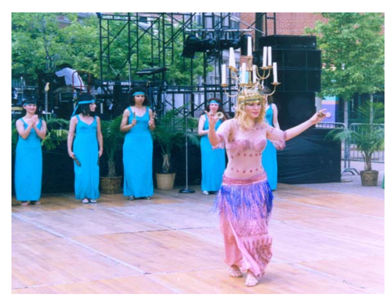
Egyptian Folkloric Troupe at the Baltimore International Festival