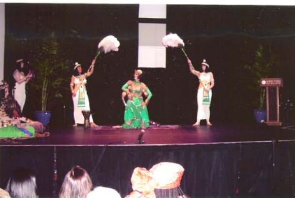
Egyptian Folkloric Troupe performing at the Walters Art Museum