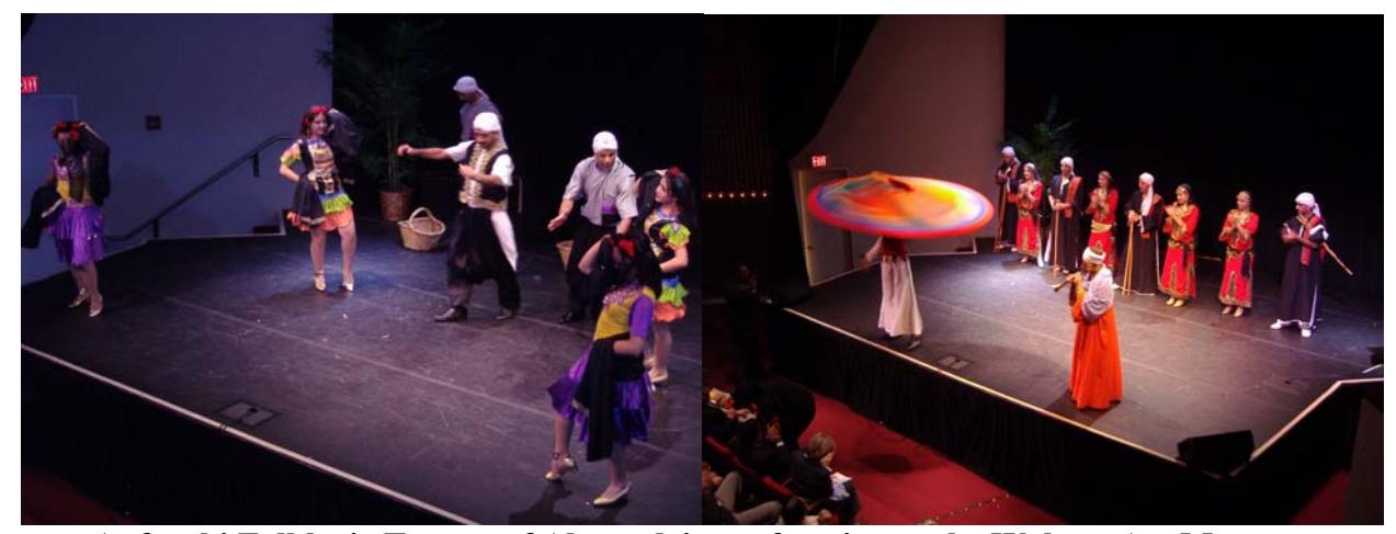
Anfoushi Folkloric Troupe of Alexandria performing at the Walters Art Museum