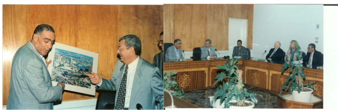
Baltimore group with the Governor of Luxor