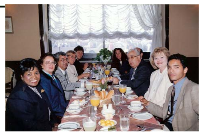
Baltimore group with the Governor of Alexandria