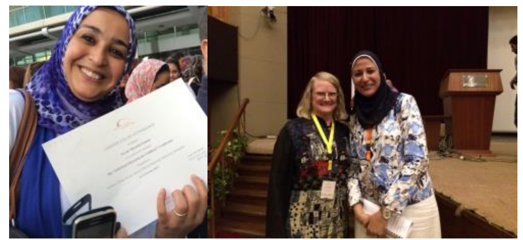
One of 600+ attendees with her conference certificate