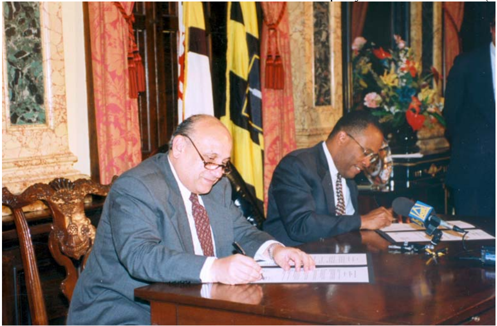
Egyptian Ambassador Ahmed Maher & Mayor Schmoke signing Baltimore/Alexandria Sister City Agreement

The Baltimore-Alexandria sister city agreement was signed in City Hall by Mayor Kurt Schmoke and the Egyptian Ambassador in USA, Mr. Ahmed Maher El Sayed, on 19/9/95. A dinner/dance fundraising party celebrating the signing of the sister city agreement with Alexandria took place in the Baltimore Convention Center on 10/21/95. The party was well attended (+350 persons).