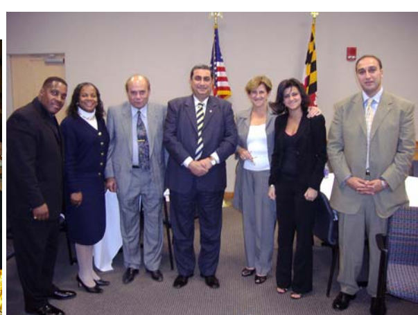
Egyptian Business Delegation