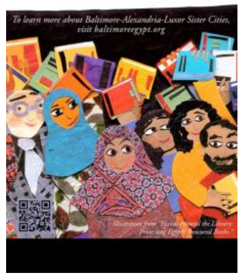
Banner displayed at Enoch Pratt Free Library, Baltimore for Arab American Heritage Month 2014

PLEASE JOIN US IN CELEBRATING APRIL AS ARAB AMERICAN HERITAGE MONTH أبريل ـ شهر الثراث العربي الأميركي