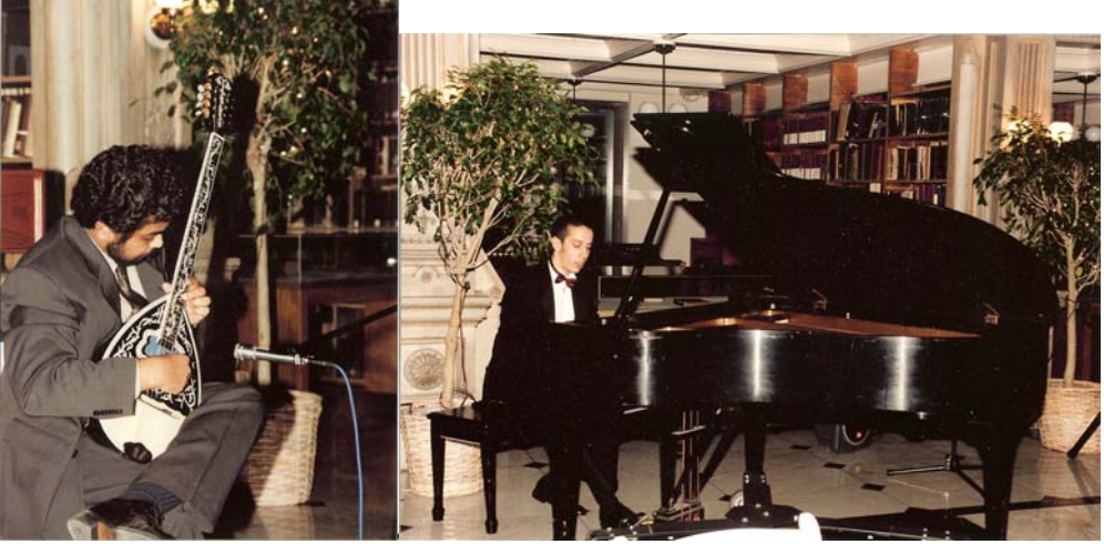
Gala Event for the Alexandria Governor & his delegation at the Peabody