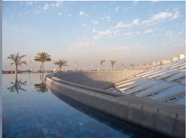
Library of Alexandria