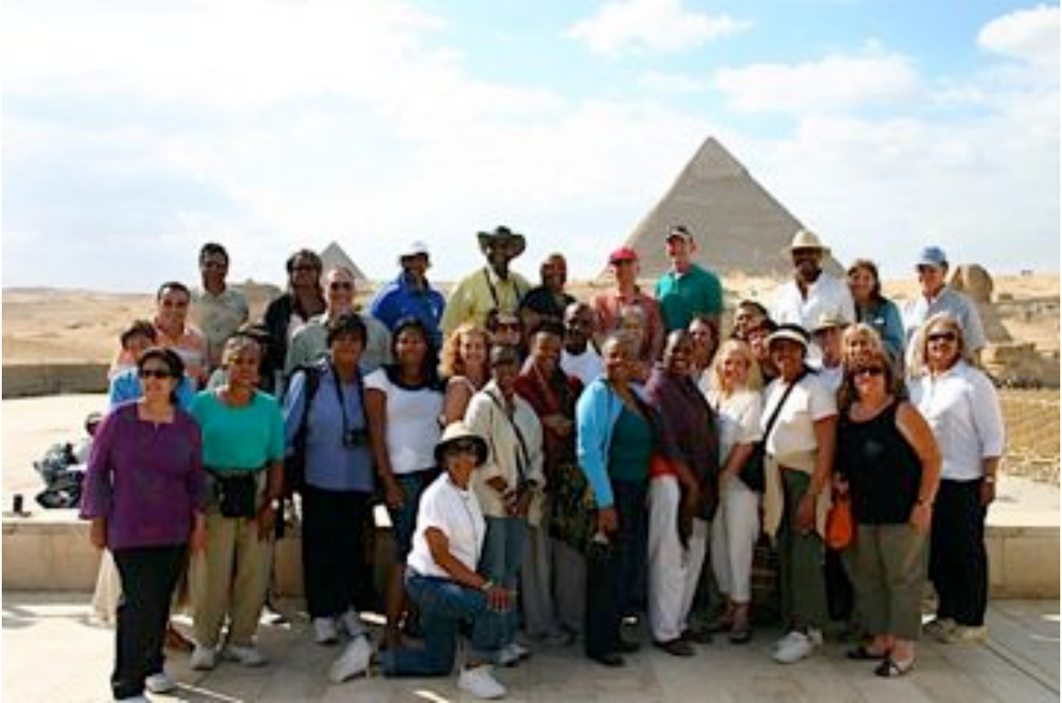
The Baltimore tour group at Giza Pyramids

All travelers on this trip marveled at the beauty and splendor of Egypt. Several comments the BLASCC received about the trip include: