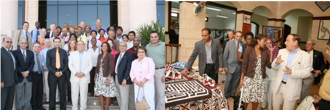
Baltimore group, Mayor Dixon & Governor Farag

While there, members of the BLASCC had the opportunity to launch the Egyptian Corner website that acts a portal for accurate information regarding political, economic, cultural, educational, and social life in Egypt. The BLASCC also had the pleasure of announcing the commencement of the Baltimore Friends of the Suzanne Mubarak Library of Luxor established for mutual cooperation and exchange of resources.